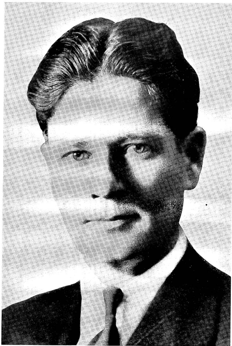
Governor Philip F. La Follette.