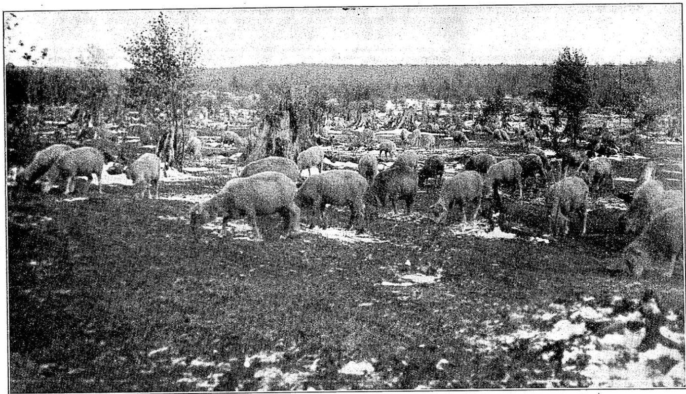
Sheep Raising is becoming an Important Industry in Northern Wisconsin.