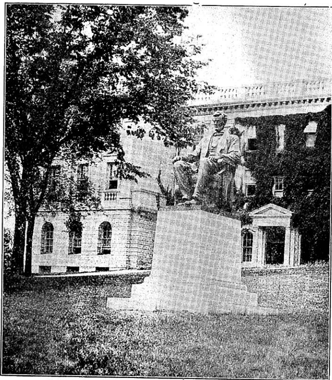
LINCOLN TERRACE AND BASCOM HALL OF THE UNIVERSITY OF WISCONSIN, A POPULAR MEETING PLACE FOR STUDENTS AND A MECCA FOR GRADUATES.