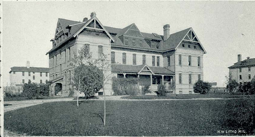
WISCONSIN INDUSTRIAL SCHOOL, FOR GIRLS, MILWAUKEE.