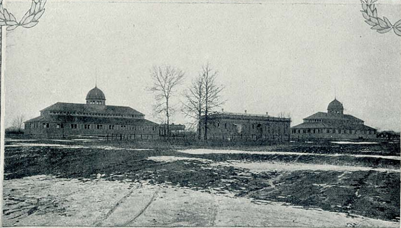
WISCONSIN STATE FAIR GROUNDS, NORTH GREENFIELD.