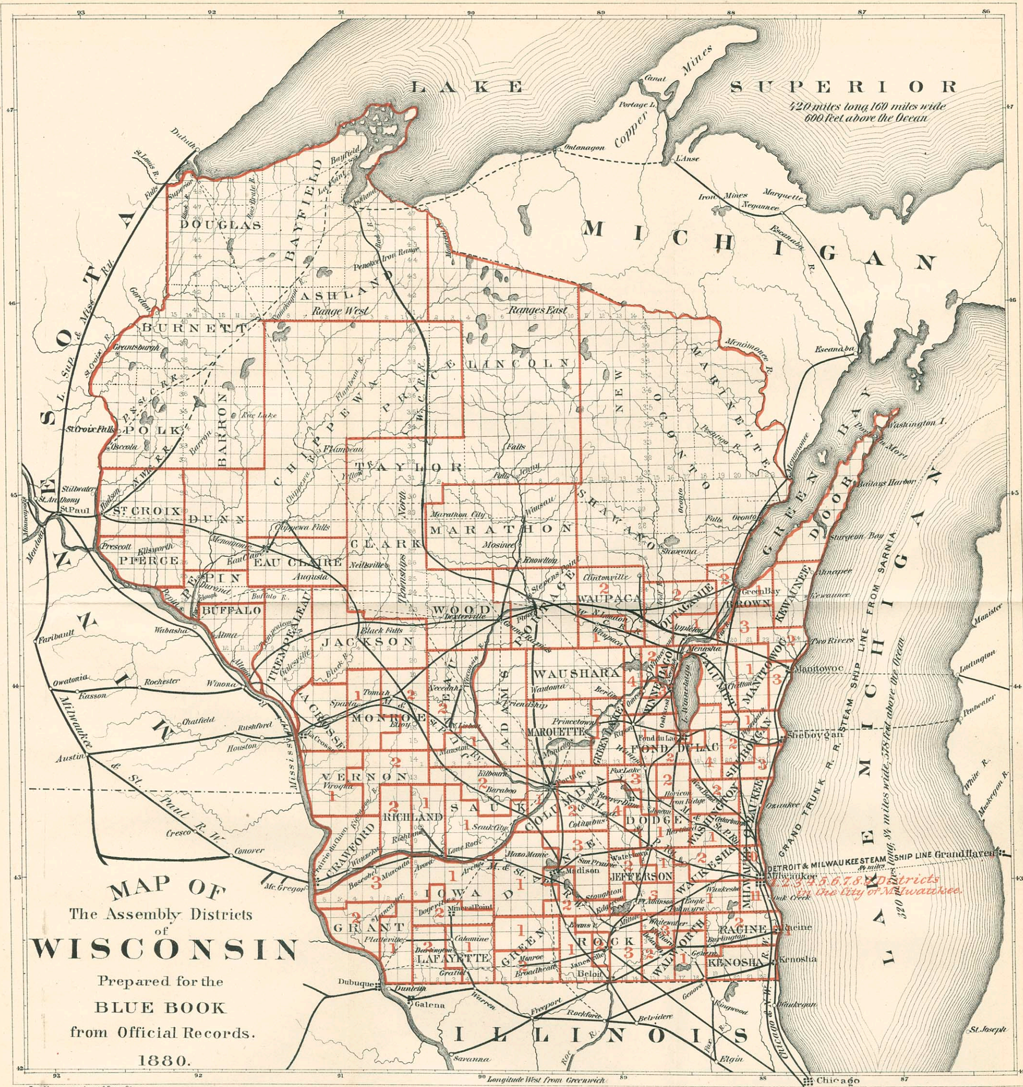
MAP OF The Assembly Districts of WISCONSIN Prepared for the BLUE BOOK from Official Records. 1880.