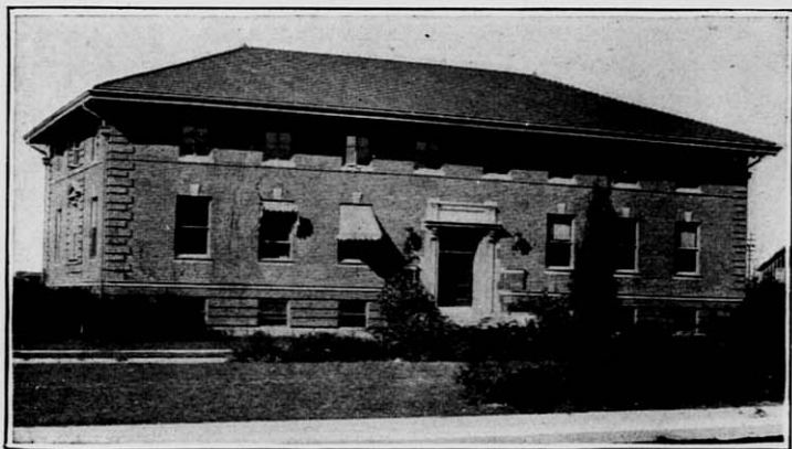
The Agronomy Building

Students who pay for the entire course, but who drop out at the end of the first or second term, are refunded two-thirds or one-third, respectively, of the entire fee. Students must notify the Director of Winter Courses on the day of withdrawal in order to secure refunds.