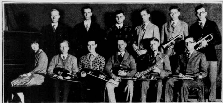
Winter Course Orchestra

The Literary Society is conducted every Tuesday night by the students in the Winter Courses. At the weekly meet-