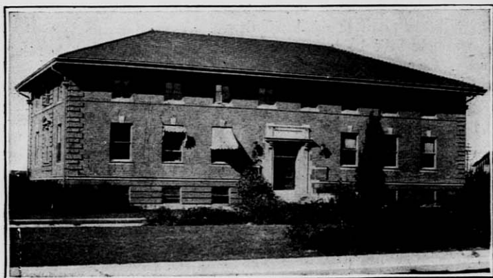
THE AGRONOMY BUILDING

Students who pay for the entire course, but who drop out at the end of the first or second term, are refunded two-thirds or one-third, respectively, of the entire fee. Students must notify the Director of Winter Courses on the day of withdrawal in order to secure refunds.