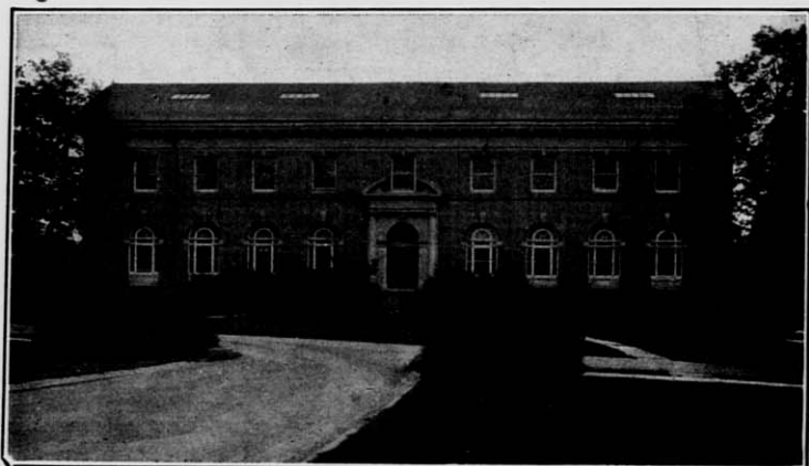
THE HORTICULTURAL BUILDING

Special Work. Men are wanted for special work in dairy manufacturing and take the Dairy Course. Others strengthen their preparation in machinery, farm business, poultry and other lines and often secure positions requiring this special preparation.