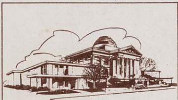
OSHKOSH PUBLIC LIBRARY OSHKOSH, WISCONSIN

Do not remove from Historical Office. 7th copy available.