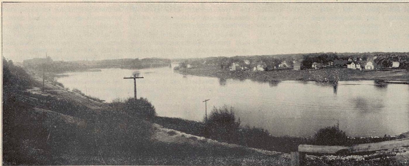
SCENE ALONG ROCKFORD, BELOIT & JANESVILLE RAILWAY NEAR BELOIT.

This syndicate is a large operator of Electric properties throughout the country and has planned numerous extensions and improvements for the Rockford and Interurban Lines.