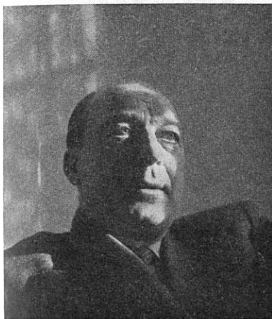
Larry Rue Chicago Tribune