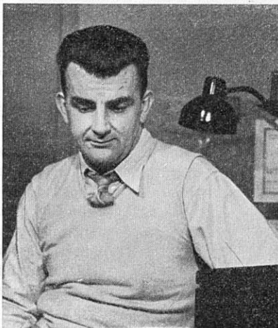
Wes Gallagher Associated Press