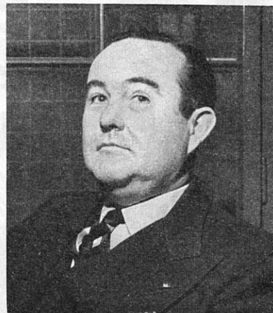
Drew Middleton New York Times

is the modern white parliament building overlooking the Rhine, but the chancellor himself lives some miles south and across the river, while the president receives official callers in still another suburb.