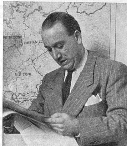
Thomas Agoston International News Service

furt and Bonn file approximately 6,000 words a day to the United States.