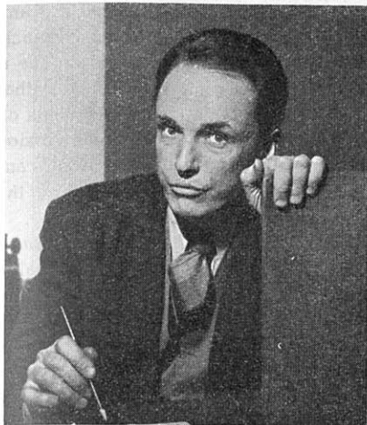
Walter Rundle United Press