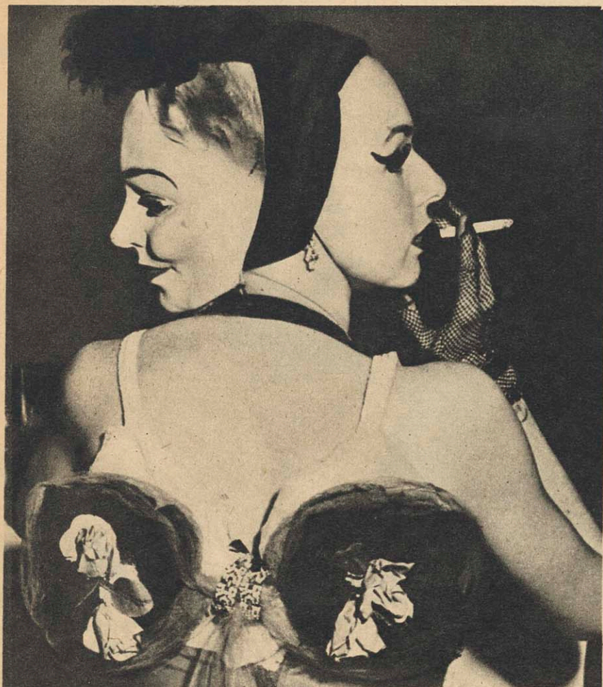
TWO-FACED beauty who bewildered bohemians at New York Bal Schizofantastique seemed to be coming and going simultaneously. Lady's split-personality get-up won an award.

ALL THE WORLD'S A STAGE, AND ONLY YESTERDAY THESE PLAYERS ACTED OUT THESE EXPRESSIVE PARTS