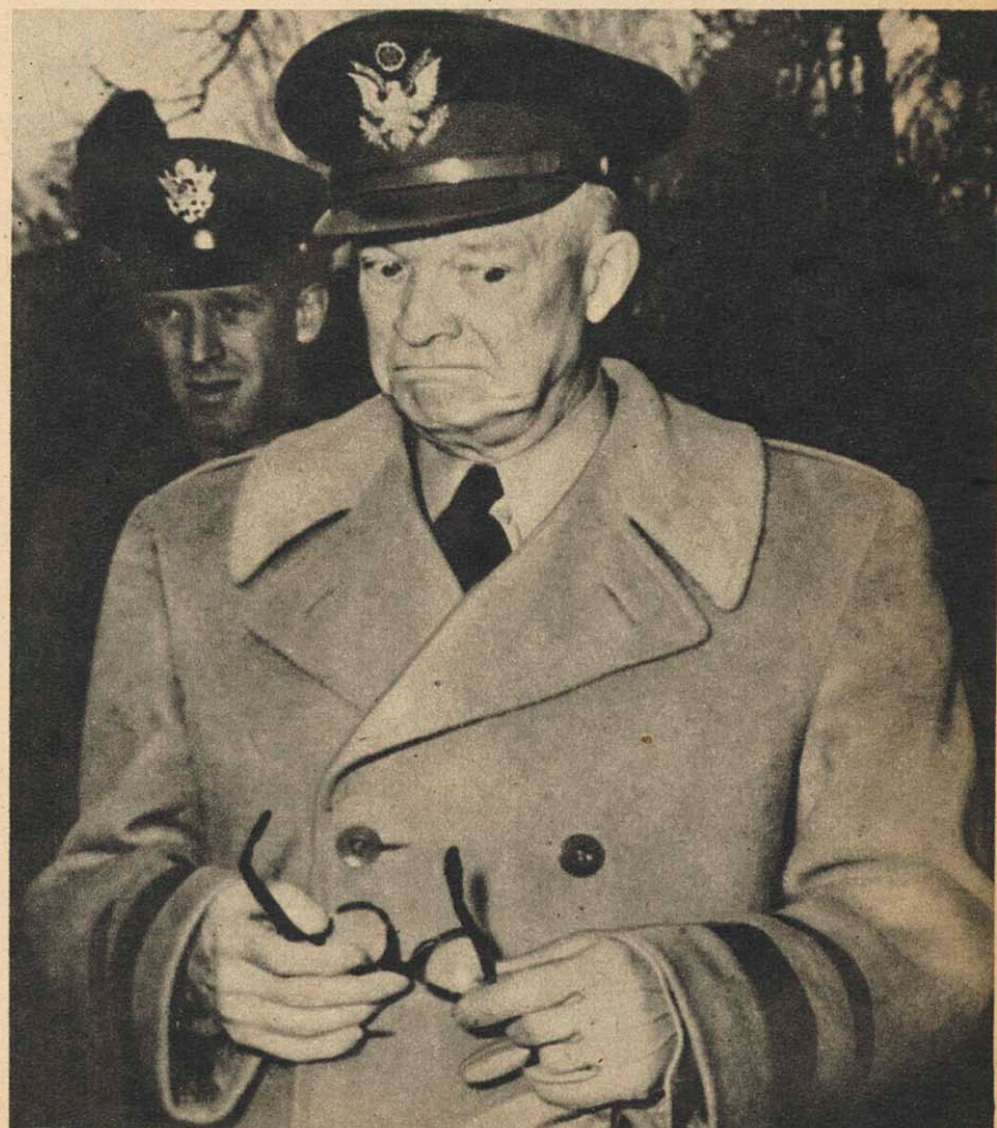
GROWLIN' SAD five-star General Eisenhower reflects on five-star General MacArthur's historic dismissal. General "Ike" exclaimed, "I'll be darned," at hearing news.