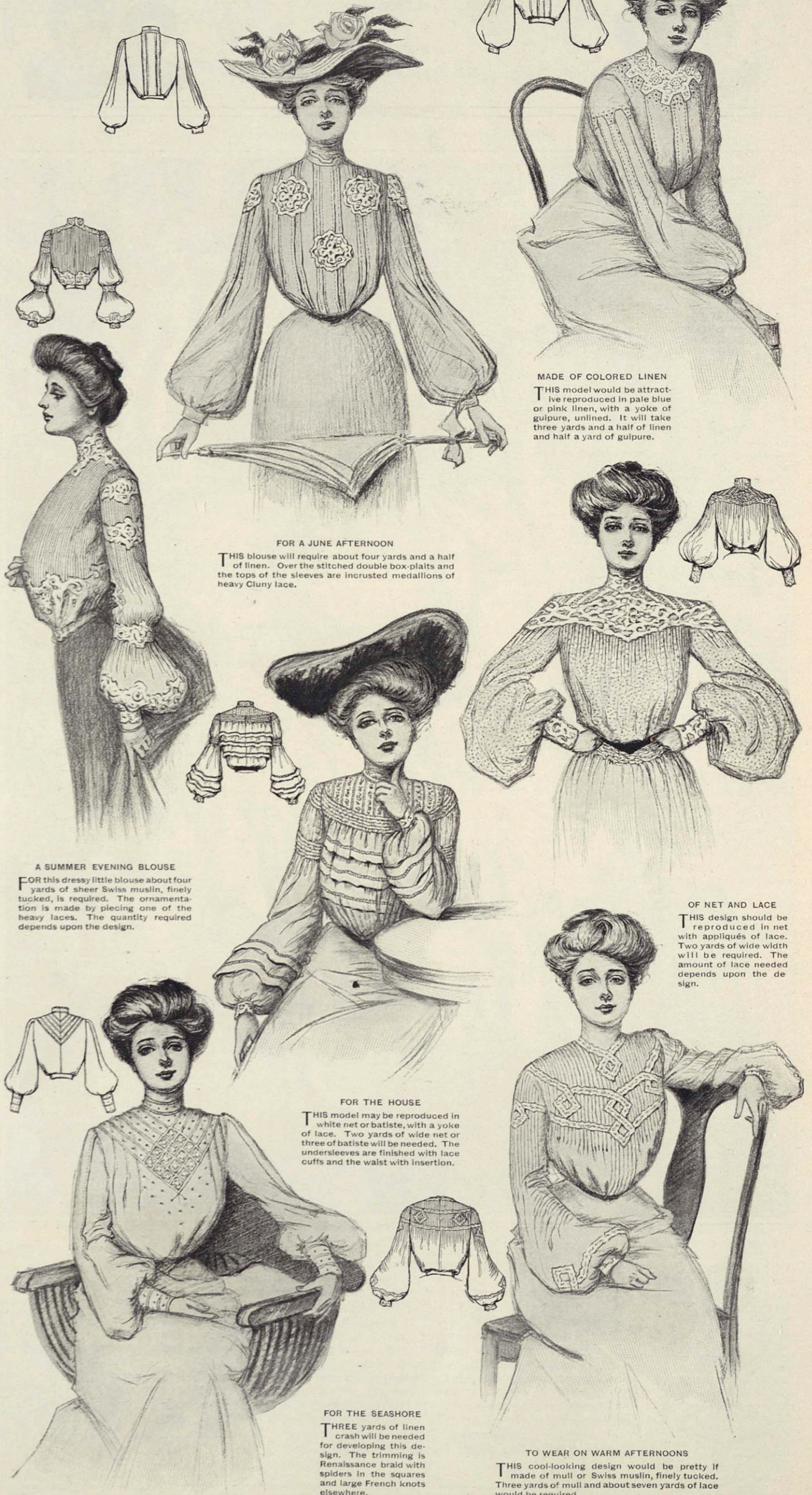
MADE OF COLORED LINEN THIS model would be attractive reproduced in pale blue or pink linen, with a yoke of gulfure, unlined. It will take three yards and a half of linen and half a yard of gulfure.