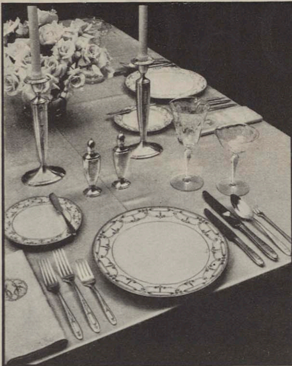
Here is the Grosvenor design in silver and china