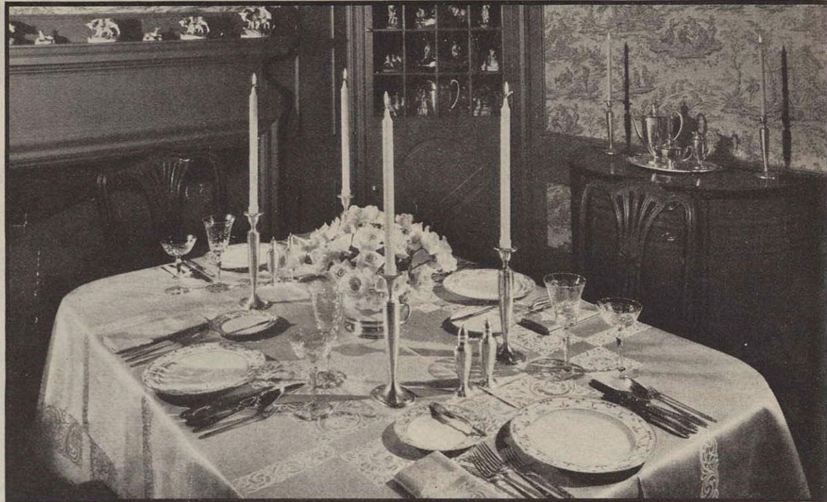
In the friendly Georgian dining-room shown on page 18, this candle-lighted table glows hospitably