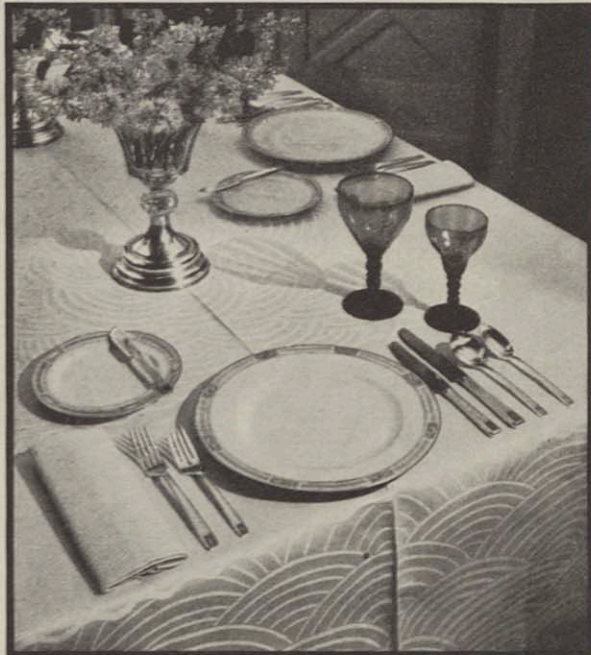
Here we used the Noblesse design in silver and china