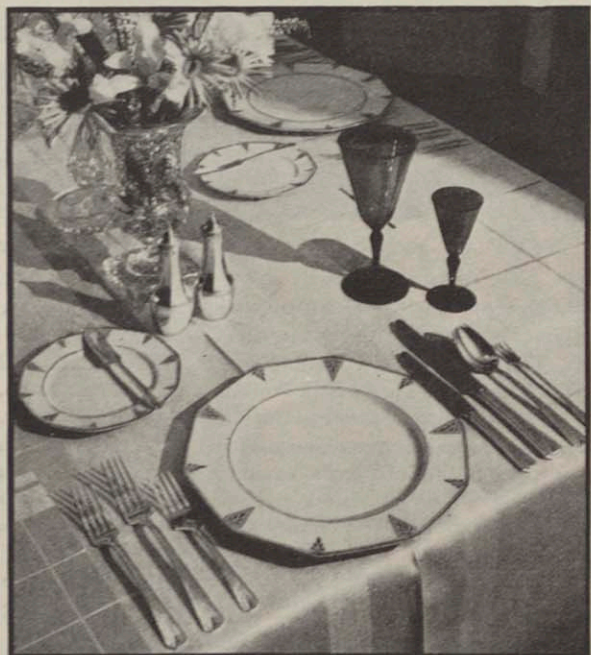
And here the Deauville design in silver and china