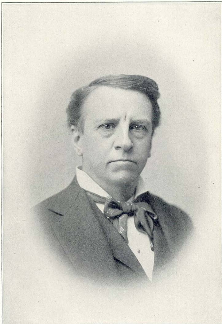
HON. JOHN C. SPOONER, United States Senator. (Term ending March 4, 1903.)