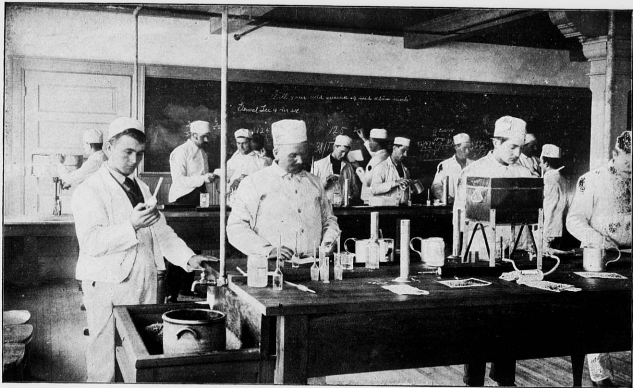
STUDENTS TESTING MILK—WISCONSIN DAIRY SCHOOL.