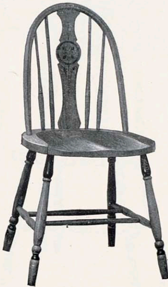
No. 2763. Chair. (For Finishes see page 86.)

Table Top 34 x 44 inches Open. Table Top 22 x 34 inches Closed. (For Finishes see page 86.)