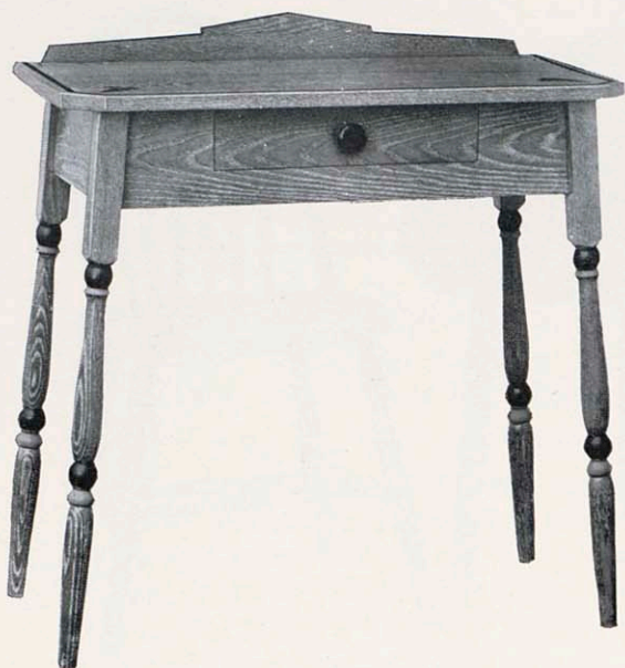
No. 2703SVR. Server. Light Grey, Blue Grey or Light Brown Dusted Oak, Decorated.