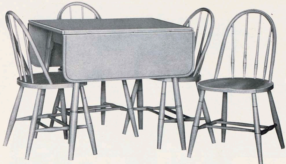
No. 2700. Table.