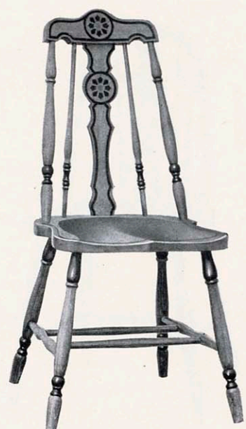
No. 2766. Chair. (For Finishes see page 86.)