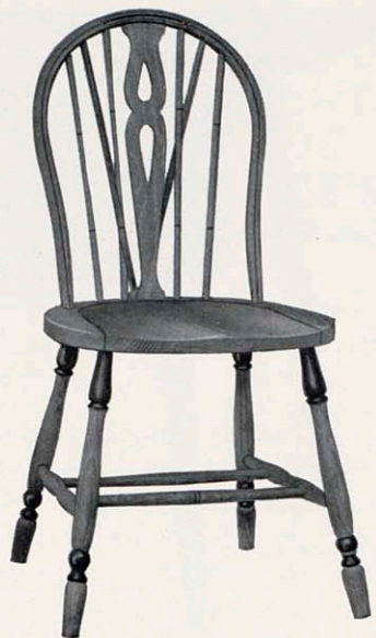
No. 2755. Chair. Light Grey, Blue Grey or Light Brown Dusted Oak, Decorated.