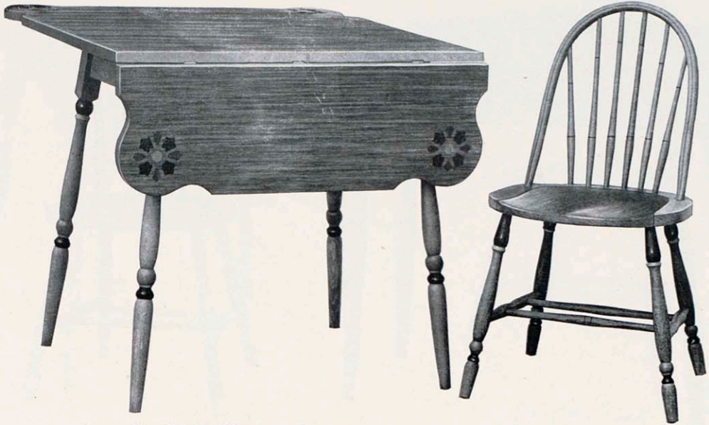
No. 2715. Linoleum Top Table.