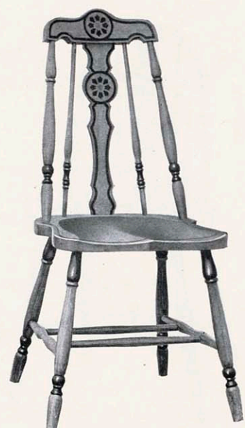
No. 2766. Chair. (For Finishes see page 86.)