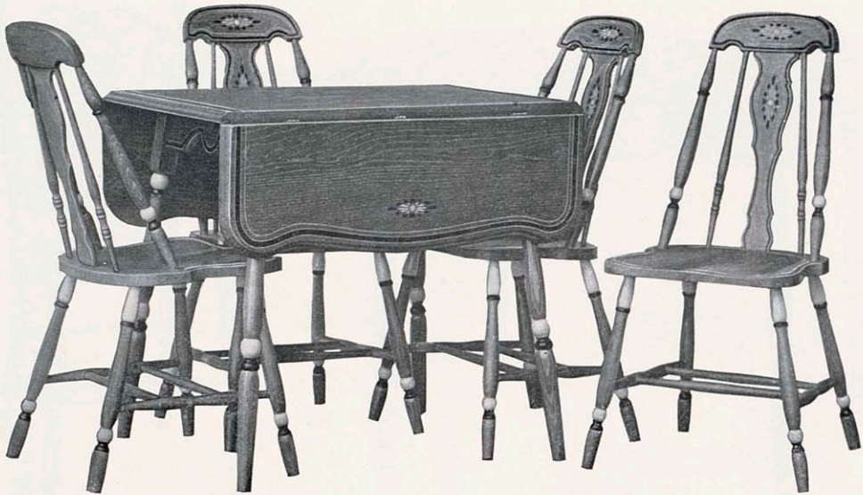
No. 2707. Table.

Table Top 34 by 44 inches Open. Table Top 22 by 34 inches Closed. Light Grey, Blue Grey or Light Brown Dusted Oak, Decorated.