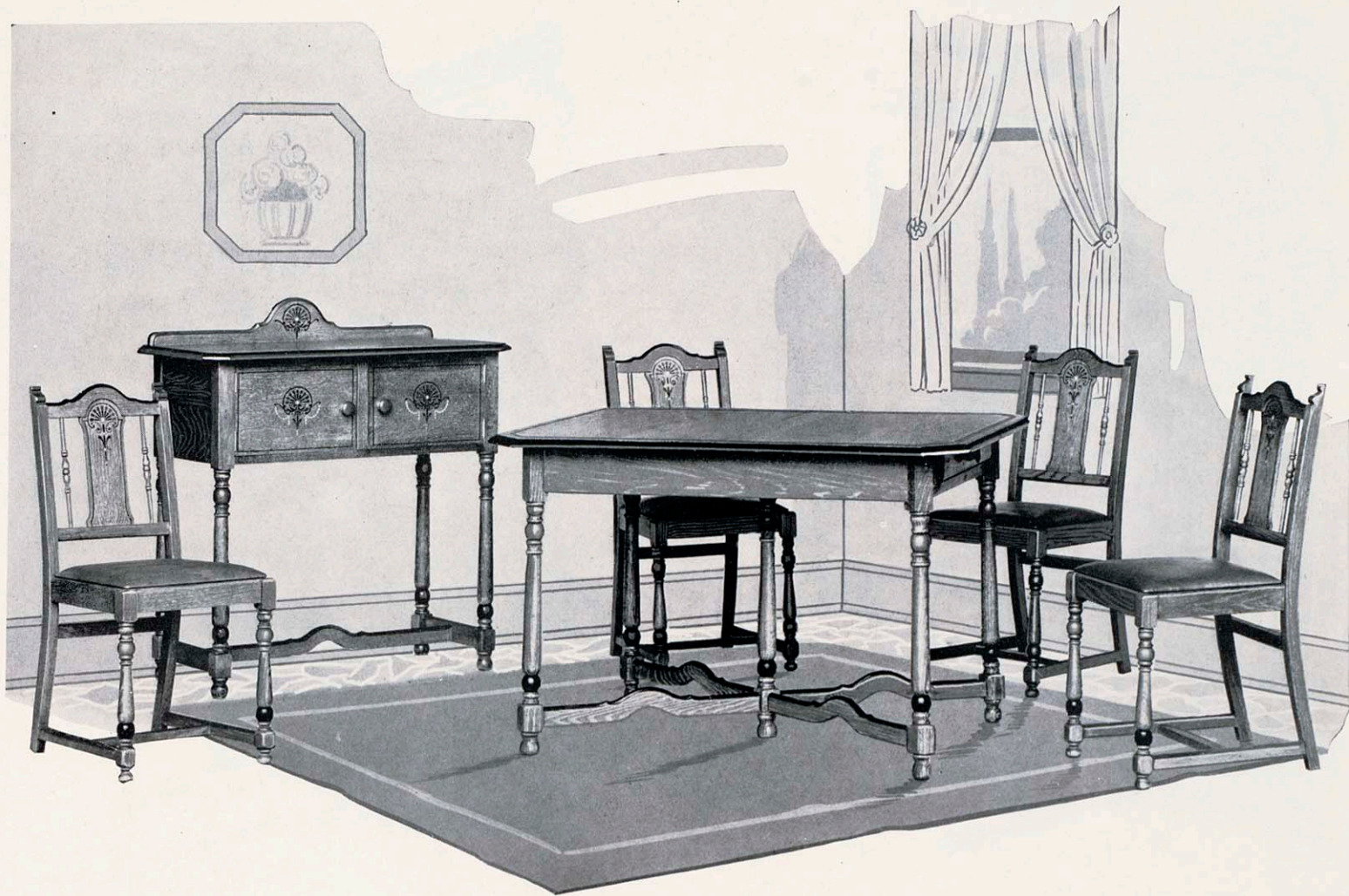
No. 2720. Table.