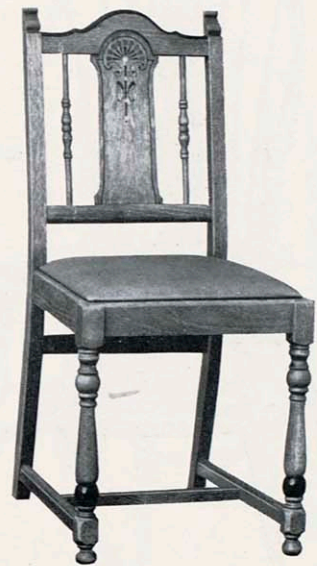
No. 2760U. Chair. Light Grey, Blue Grey or Light Brown Dusted Oak, Decorated. Imitation Walnut or Brown Mahogany, Decorated.