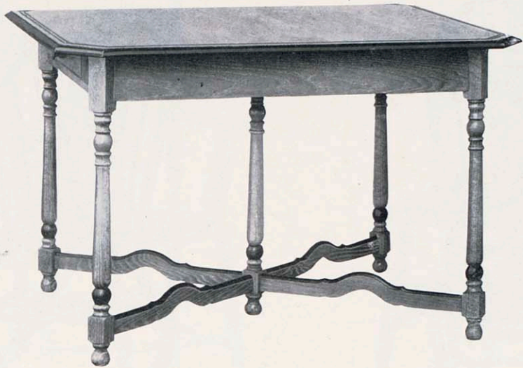
No. 2720. Table. Table top 34 by 44 inches extends to 72 inches. Light Grey, Blue Grey, or Light Brown Dusted Oak, Decorated. Imitation Walnut or Brown Mahogany, Decorated.