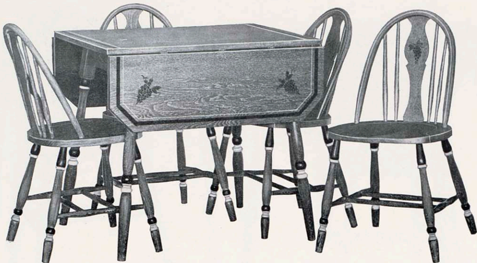
No. 2703. Table.