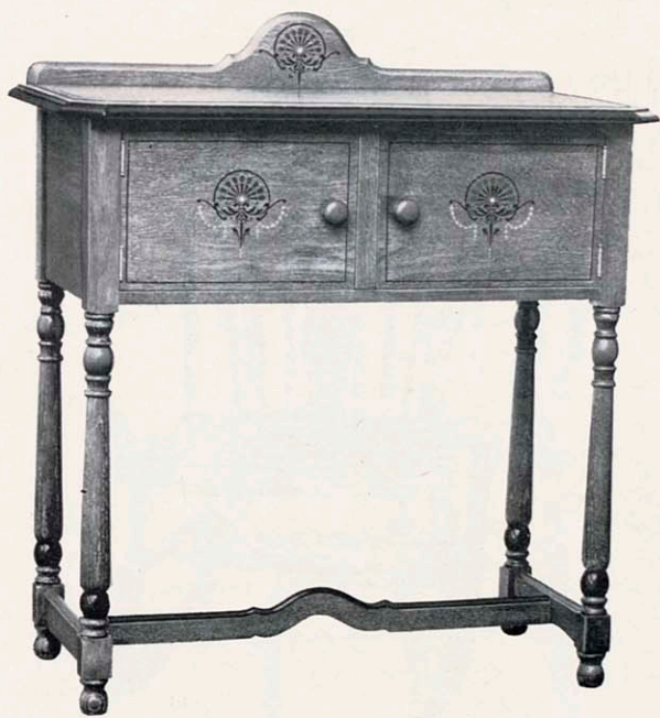
No. 2720SVR. Server. Light Grey, Blue Grey or Light Brown Dusted Oak, Decorated. Imitation Walnut or Brown Mahogany, Decorated.