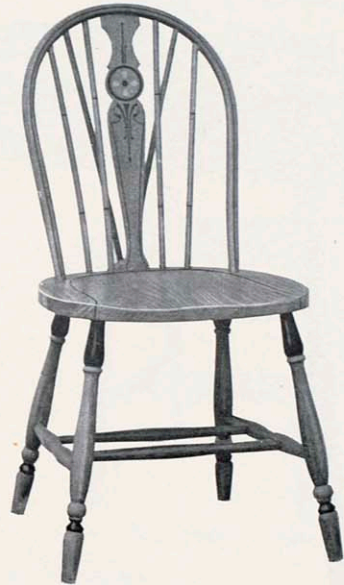
No. 2765. Chair. (For Finishes see page 86.)