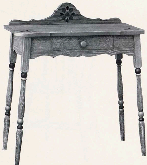
No. 2715SVR. Linoleum Top Server. (For Finishes see page 86.)