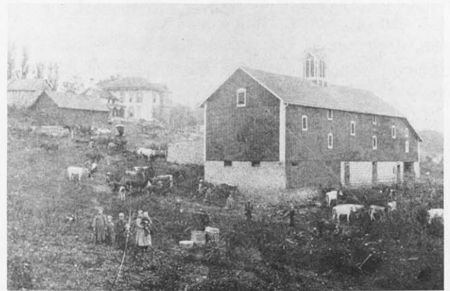
Kittleson farmstead c. 1894