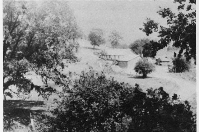
York Prairie Cheese Factory in 1936