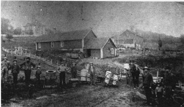
The Indian Hill Cheese Factory

The present day Kittleson Road, remembered by locals as Kittleson Valley, is named for the Ansteinson-Staulen-Kittleson Family.