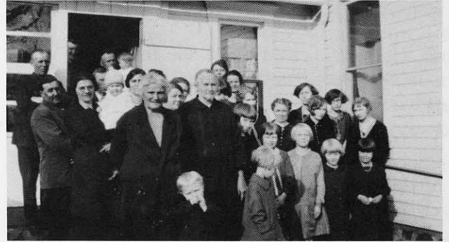
Ladies Aid at the Ness Home