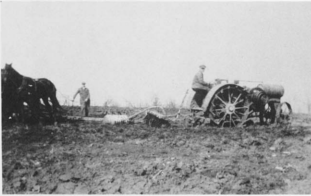
The Brynjulfson farm, April 28, 1926