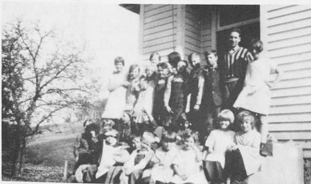
The students at Tyvand School in c. 1928-29