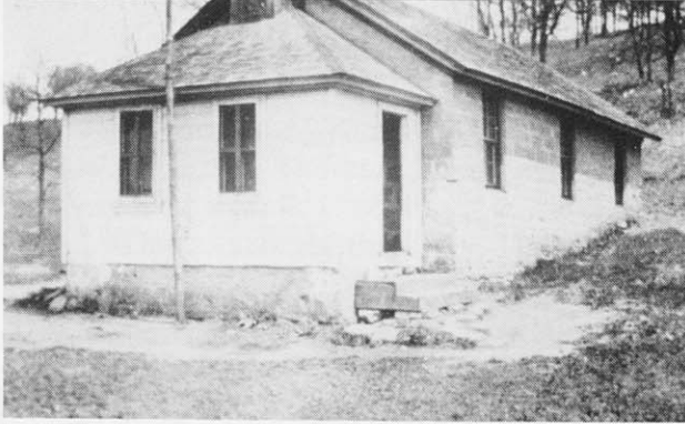
The First Tyvand School