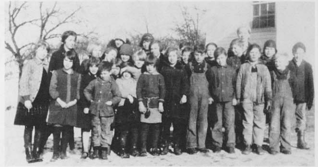
Last day of school April 26, 1928

The number of students who attended the Tyvand School ranged anywhere from 25 to 40 students in a given year. Seating in the school was 2 pupils to a desk and sometimes 3 pupils to a desk among the younger students.