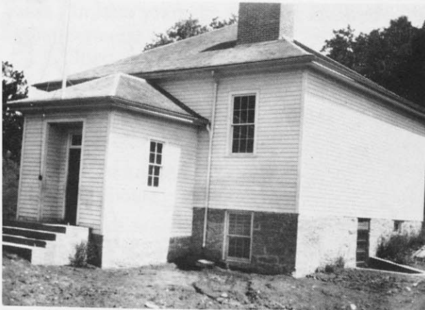
The second Tyvand School

The first school was built of rock before 1873. In 1923-24, a new, square, frame structure was built to replace the old rock building.