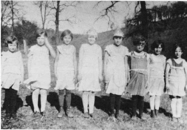
Schoolgirls - Tyvand District