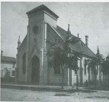
169 St. Paul's German Lutheran Church 1883, steeple 1893 Photograph 1888.