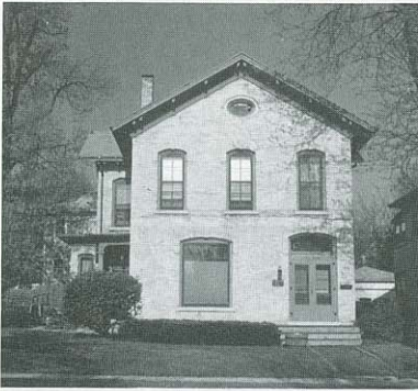
120 ca. 1876

One of few brick houses in the District, 120 retains most of its original details including bracketed eaves, prominent hoods at the windows and entry, and an elliptical window in the gable end. Charles B. Withington, who resided here between about 1876 and 1905, was an inventor.