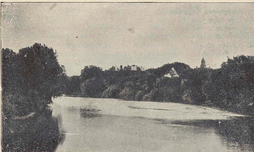
North on Rock River from Grand Avenue Bridge.