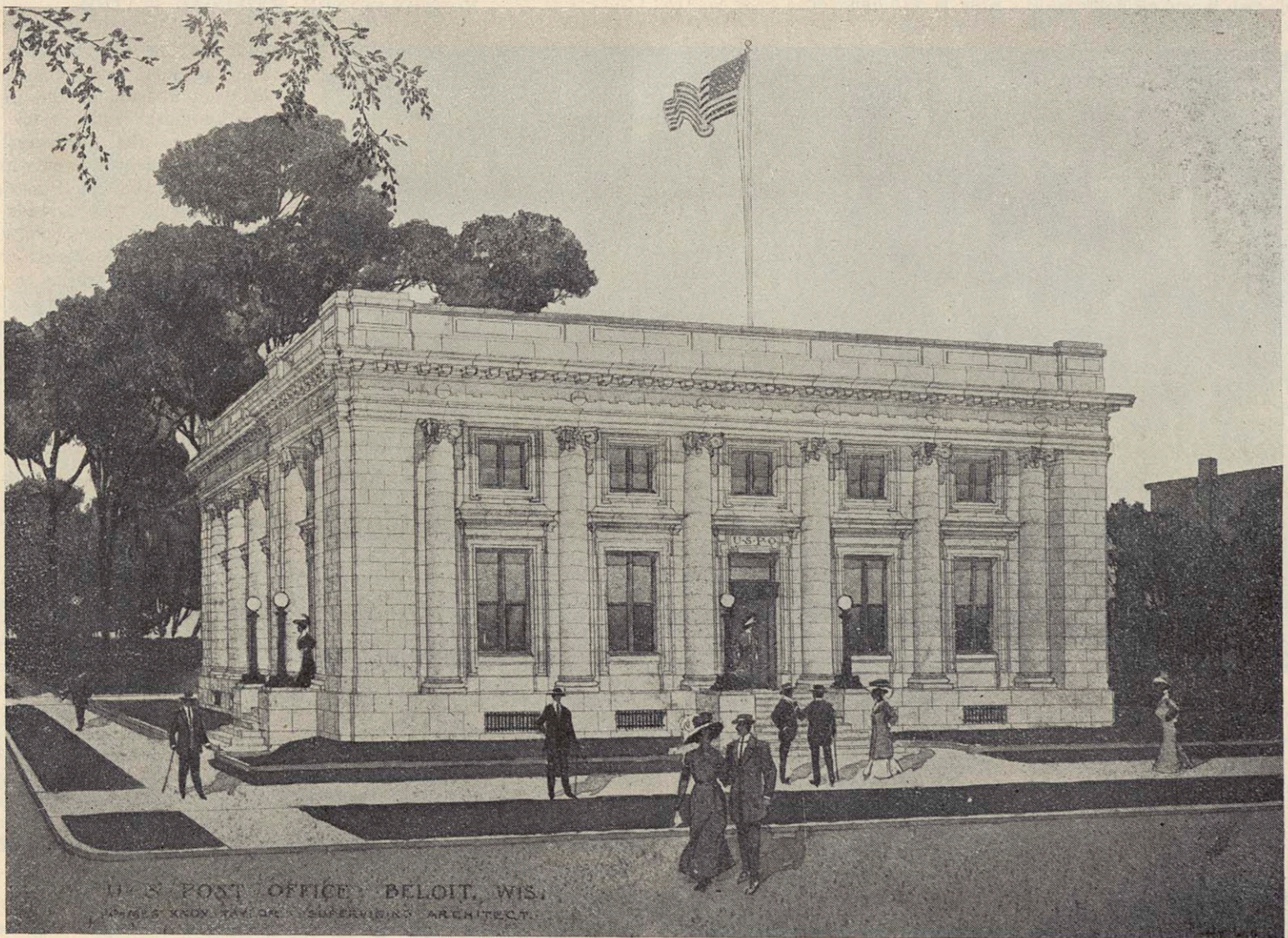
BELOIT'S NEW POSTOFFICE.