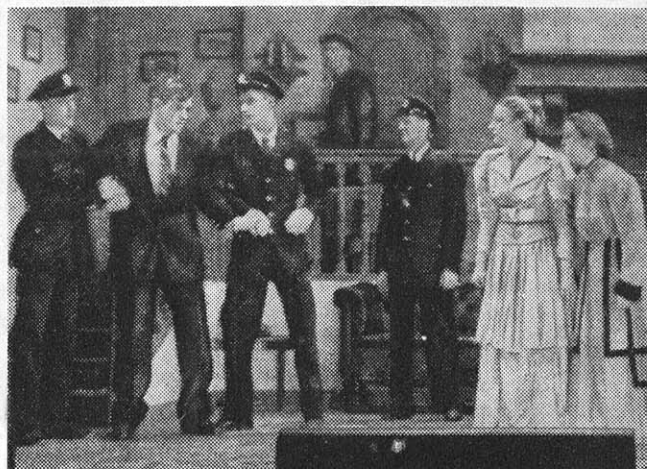
American celebrities brought to EUCOM by Special Services in the last four years include, left, Miss Marjorie Lawrence, world-famous dramatic soprano, pictured here at Wiesbaden in 1948. Right, "Arsenic and Old Lace," with all-GI and hostess cast, presented at Munich in January 1949 with costumes furnished by ESS.