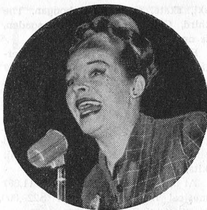
The inimitable Martha Raye at the 6th TT Special Services Club in Mannheim during her busy 1948 tour.

* Basic foods are supplied to dependent families by the QM Sales Commissaries.