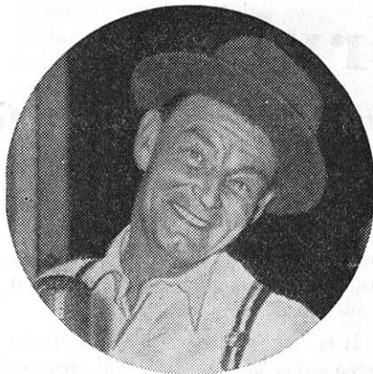
"Archie of Duffy's Tavern," otherwise Ed Gardner, radio comedian, at AFN's Hochst studios in Sept. 1948.

For the first six months of 1949 a total of 1,118,709 books was circulated