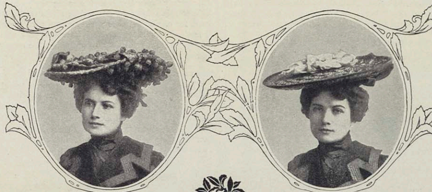
A STIFF straw hat intended for general wear. It is made of coarse straw and trimmed with fruit in a blended scheme of color. The facing is of finely tucked chiffon.