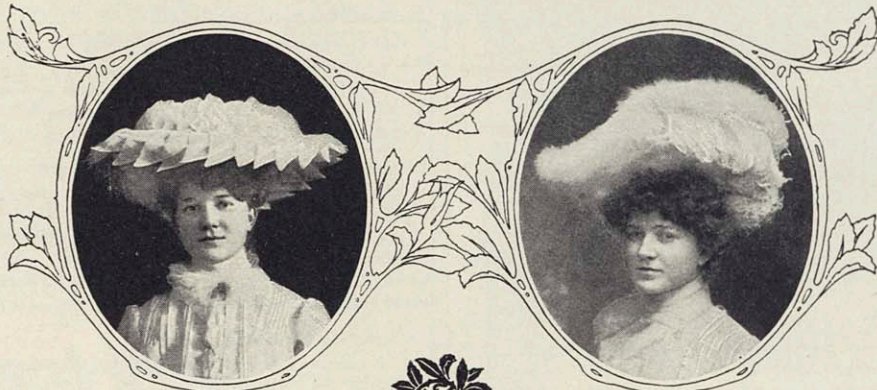
THIS hat may be made of either organdy or silk, the brim being formed after the pattern of a rose petal. The trimming is a double plissé quilling of chiffon, and the facing is of tulle.