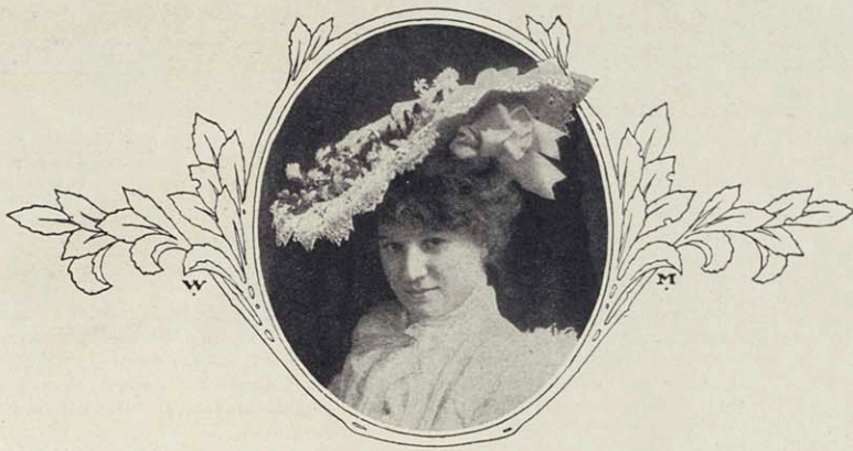
THIS Gainsborough picture hat is made of Irish point lace. The facing is of tulle. The edge of the lace droops over the edge of the brim. The trimming consists of a wreath of flowers around the crown. A chou of soft satin taffeta ribbon is placed under the brim at the left side. The model may be developed in all-over embroidery.