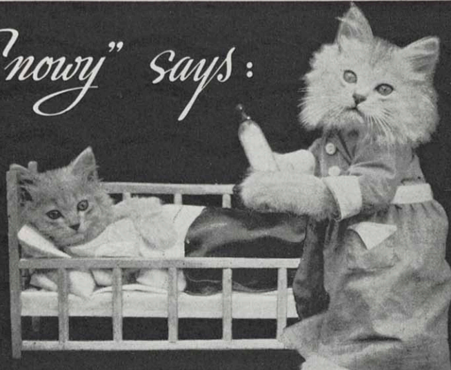
PHOTOGRAPHED FROM LIFE—NO. 8 OF A SERIES

"Getting the kiddies to bed early is no problem when you use Utica or Mohawk sheets . . . Their smooth, soft texture always bring purr-fect sleep . . . and they are wonderful for keeping their whiteness . . . I haven't a mouse-gray sheet in my linen closet . . . As for wear! Well, everyone knows Utica and Mohawk sheets are born with nine lives."