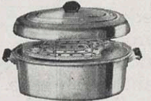
17 1/2-In. Top Range Roaster