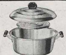
4 1/2-Qt. Dutch Oven

284 pages, 1057 recipes, beautifully illustrated, bound in washable cloth. Every recipe tested and approved by the famous MIRRO Test Kitchen.