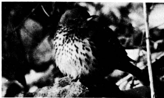
Sage Thrasher

There were many exceptional records on the Christmas Counts, the most exciting being a Sage Thrasher at Madison. This is the first state record for this species of the southwestern United States. It was subsequently seen by several observers and photographed. A White-eyed Vireo, also in Madison, was the first