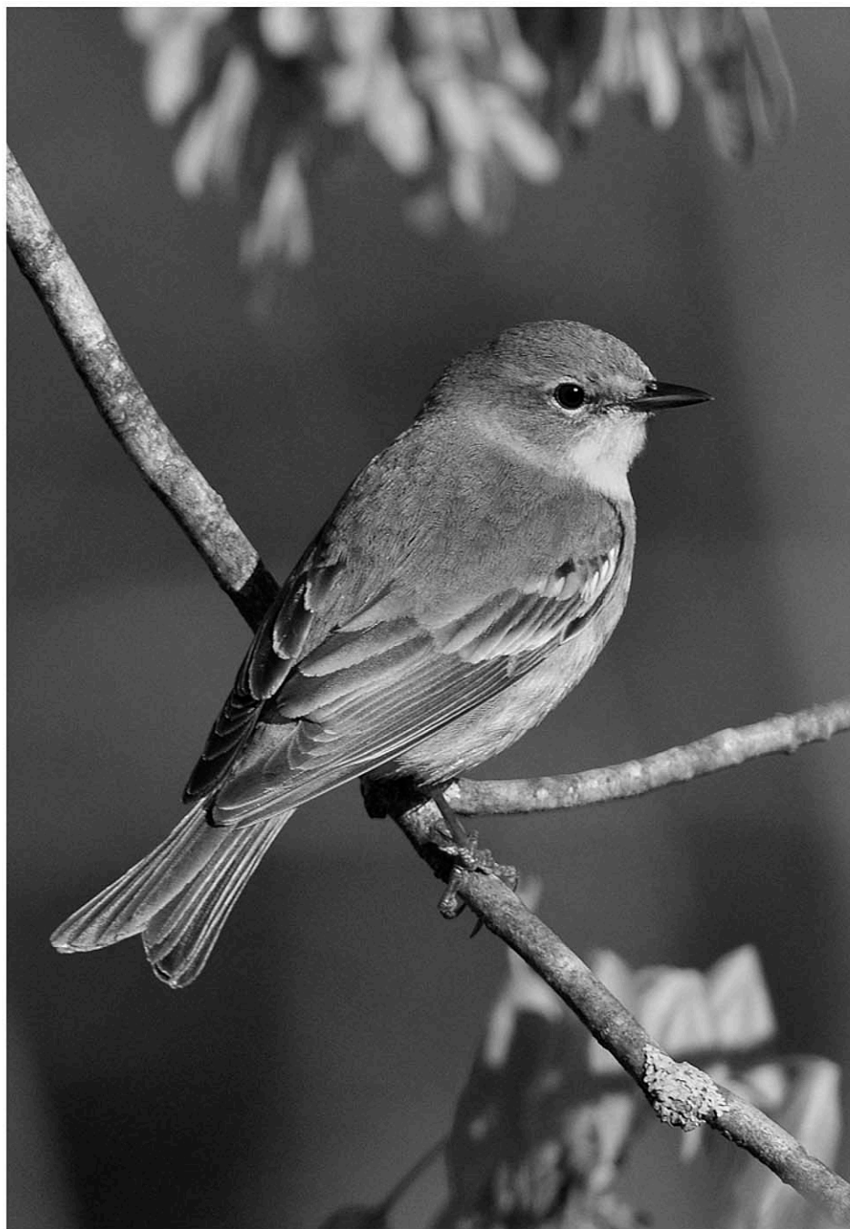
Pine Warbler from Dennis Malueg