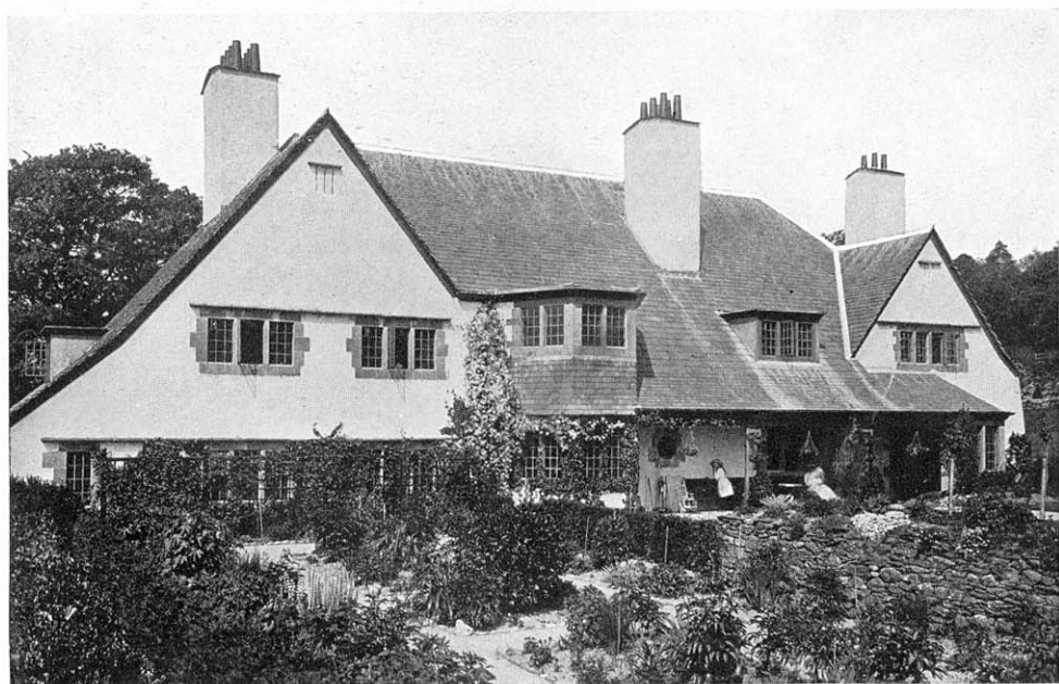
C. F. A. Voysey, Architect.

STREET VIEW OF THE "NEW PASTURE HOUSE," AT NORTH LUFFENHAM. "MOON CRAG": WINDERMERE, ENG- LAND.