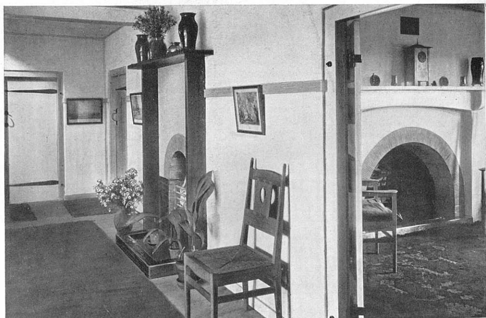
C. F. A. Voysey, Architect.

THE HALLWAY IN "MOUNT HOLLY," KNOBBY GREEN, BEACONSFIELD, BUCKINGHAMSHIRE, ENGLAND.