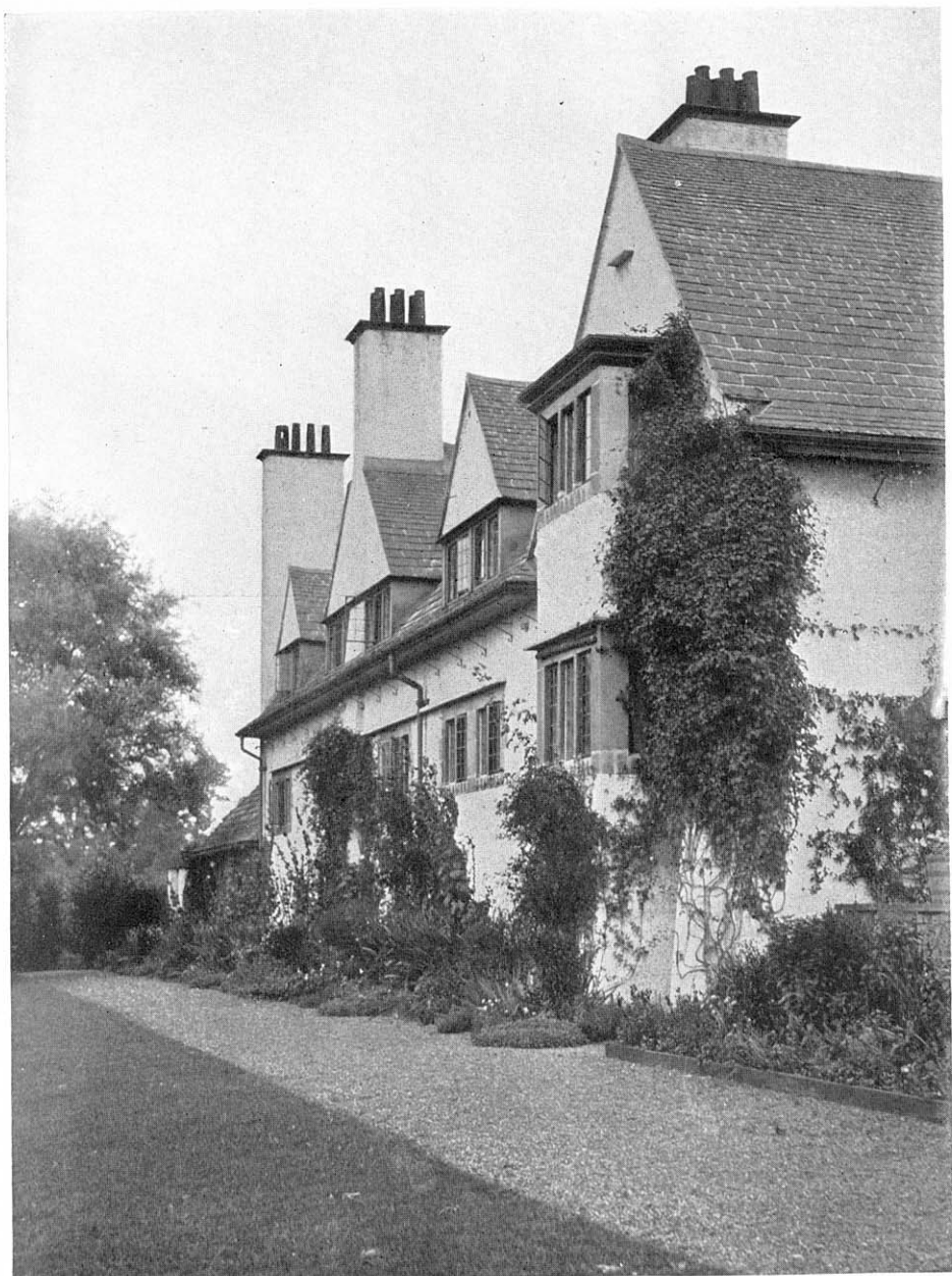
C. F. A. Voysey, Architect.